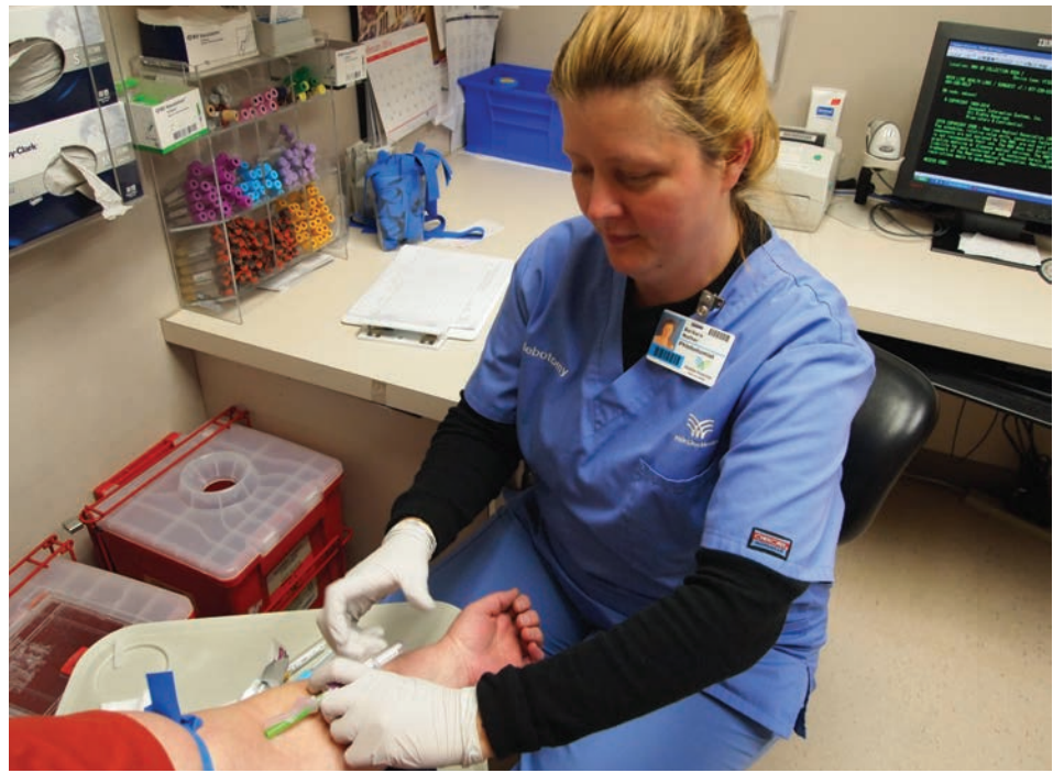
Top: The Outpatient Lab at the Lankenau Medical Center opened in 2013. It has beautiful, bright and spacious draw rooms, conveniently located near the patient parking garage. Bottom: Outpatient Lab at Riddle Hospital has a calming, cascading water fountain and player piano nearby that fills the area with melodious tunes.