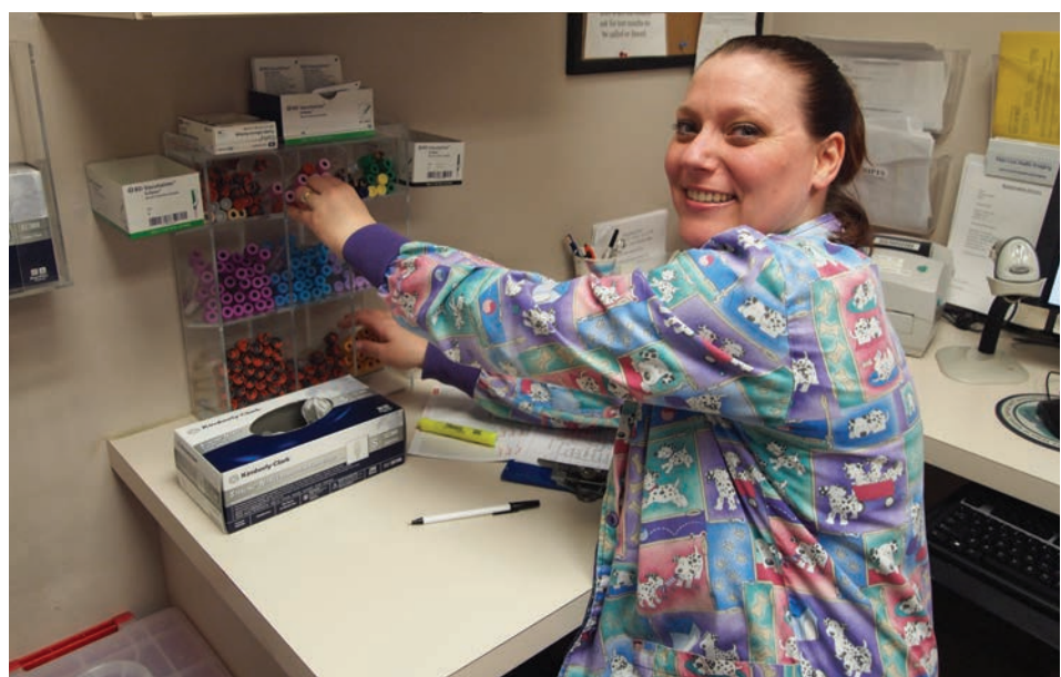
Top: The Main Line Health Center at Exton Square opened in January 2014. It is situated at the Exton Square Mall and offers weekend hours on Saturday and Sunday for lab collections. Bottom: Phlebotomist at Riddle Hospital Outpatient Lab.