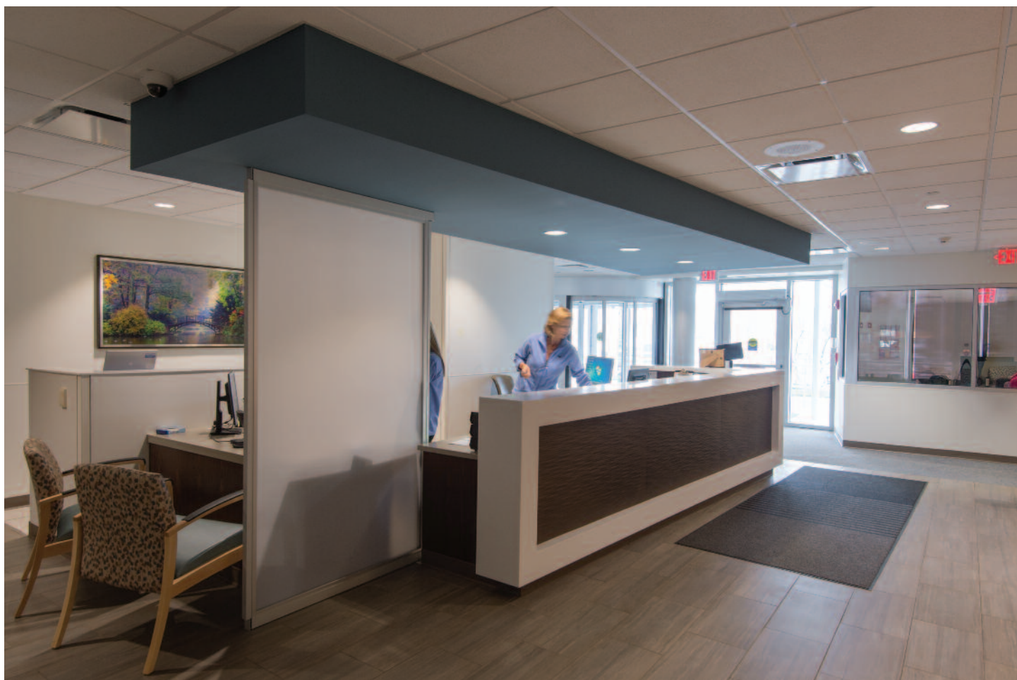
New ED waiting room welcomes patients with modern and comfortable amenities.