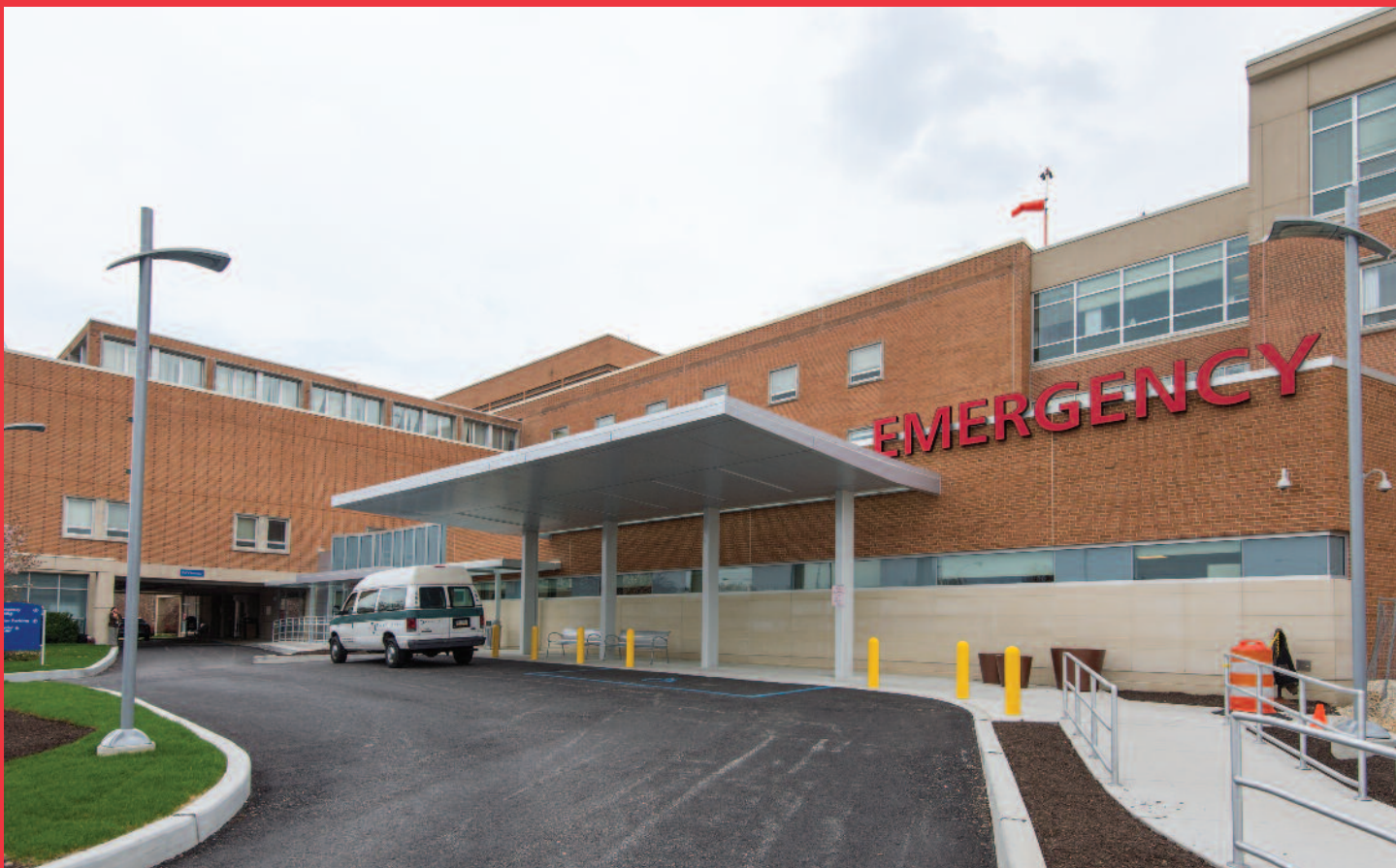
OPEN! Emergency Department facade features new sign and entrance.