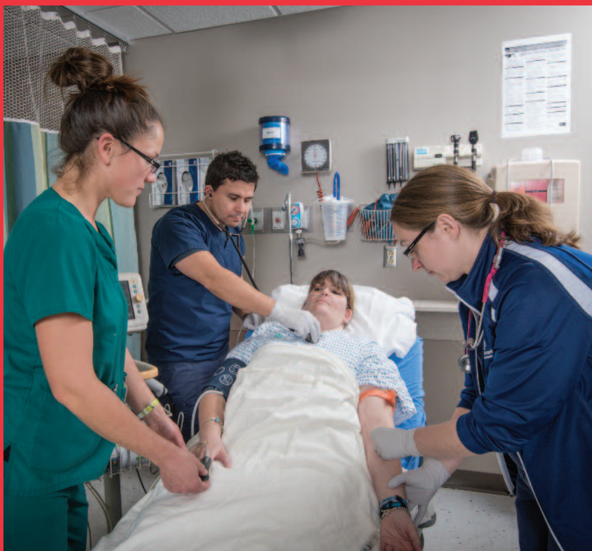
ED staff meet and care for a Rapid Evaluation Unit patient as a team.