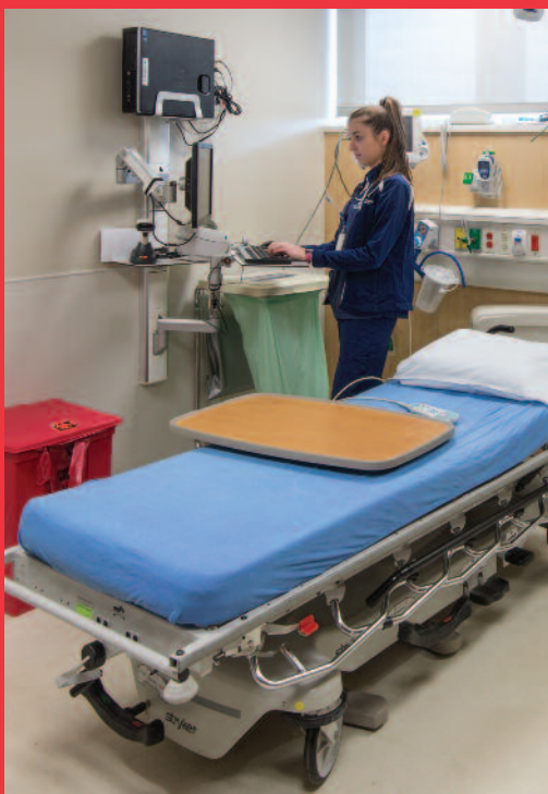
ED nurse readies one of the new patient rooms in the Rapid Evaluation Unit.