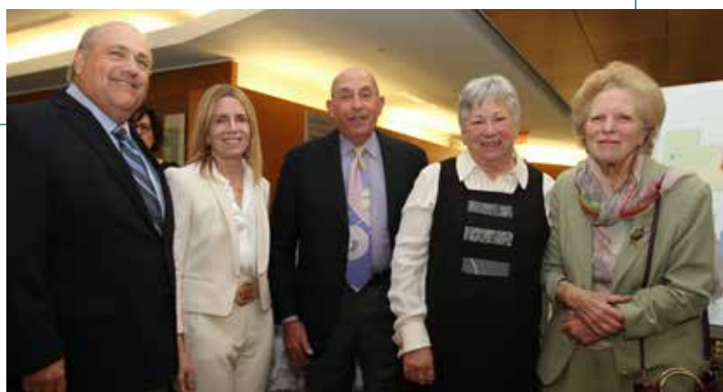
LEFT: Lankenau residents and fellows were recognized