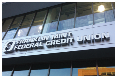
Franklin Mint Federal Credit Union

The 2014 Man O'War Gala honors the following who, through their contributions of time, talent and treasure, have enhanced Riddle's service to our community in meaningful ways.